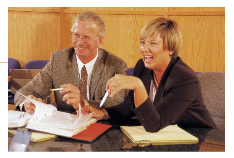
attempt to pass all the mileposts until we reach our comfort zone.

Abraham Maslow, in his Theory of Human Motivation , identified five levels of need that people strive to satisfy (in order, they are: Survival, Safety, Social, Esteem, and Fulfillment). I have found that we work through those five levels separately in each area of our lives: work, relationships, parenting, hobbies, sports, volunteering, etc. With each new endeavor, we